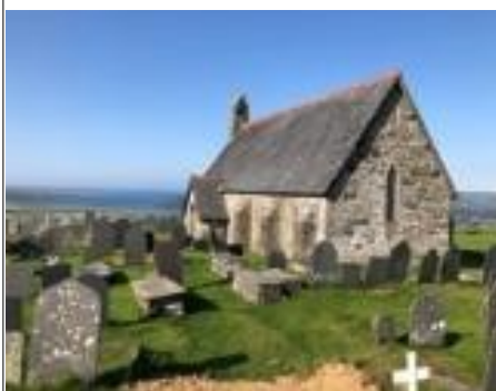
St Tecwyn's Church, Llandecwyn

Our lead article this month is on the subject of Pilgrimage, but sometimes a physical pilgrimage is not possible. The Small Pilgrim Places Network links over 80 places across the UK and the Isle of Man with the common vision of providing places for pondering, breathing, meditating, praying and 'being'.