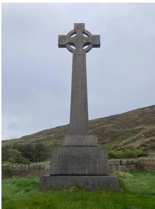
Cross on Bardsey island - photo taken on a trip by folk from All Saints last month

What has always interested me in Pilgrimage is less about the journey and more