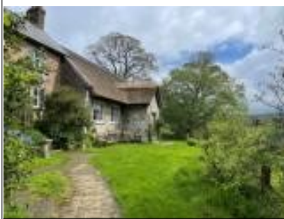
The Pales Meeting House, Llandegley

There are some Places in North Wales but before you travel anywhere in the UK why not check the website https://www.smallpilgrimplaces.org to see if you will be near any Places. Some are always open, others have limited opening times. Whether you sit in a quiet church, walk a labyrinth, or follow paths between linked Places, you will find an opportunity to step aside from the busyness of the world and get closer to your God.