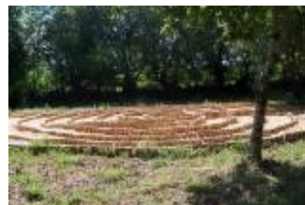
The labyrinth, Llanfihangel Rhos-y-

There are some Places in North Wales but before you travel anywhere in the UK why not check the website https://www.smallpilgrimplaces.org to see if you will be near any Places. Some are always open, others have limited opening times. Whether you sit in a quiet church, walk a labyrinth, or follow paths between linked Places, you will find an opportunity to step aside from the busyness of the world and get closer to your God.