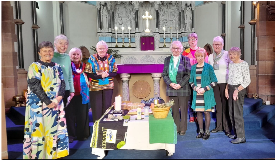
Llandudno WDoP committee at our Lady Star of the Sea